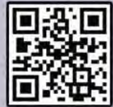
Scan to see directions